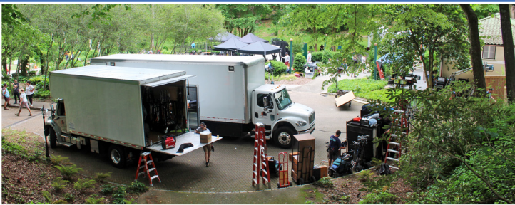
1 NEW TV SHOW filmed in the gardens!