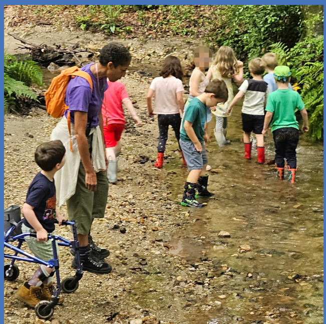
903 SPLASHES in the creek during camp!